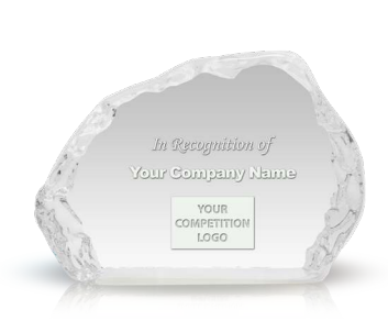
Canada's Top Regional and Special-Interest Crystal Award