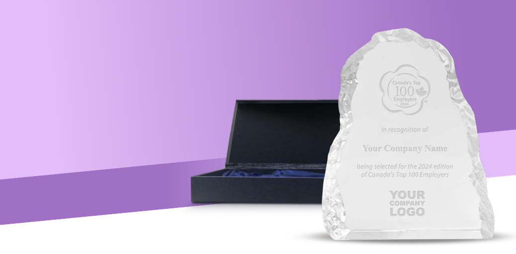
Canada's Top 100 Employers Crystal Award

To download any competition award Order Form, please visit: Top100.salesdynamics.com/awards