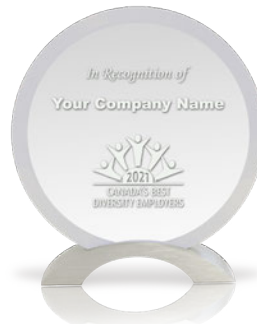
Canada's Best Diversity Employers Crystal Award