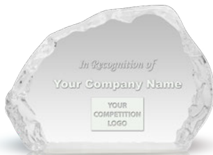
Canada's Top Regional and Special-Interest Crystal Award