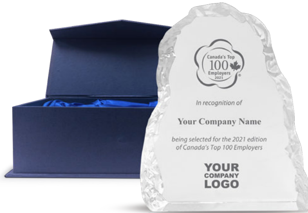
Canada's Top 100 Employers Crystal Award

To download any competition award Order Form, please visit: Top100.salesdynamics.com/awards