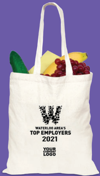
14 3 / 4 " W x 16 1 / 2 " H