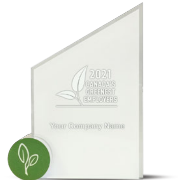
Canada's Greenest Employers Glass Award