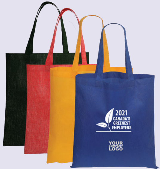
15" W x 16" H