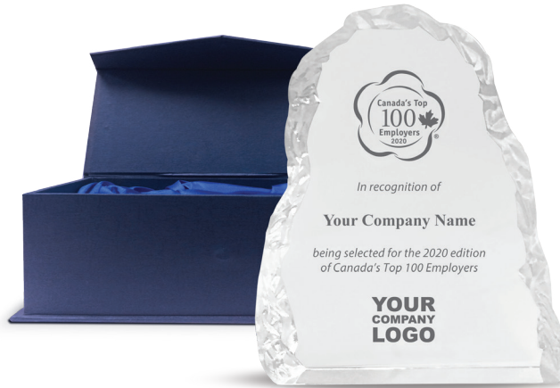
Canada's Top 100 Employers Crystal Award

To download any competition award Order Form, please visit: Top100.salesdynamics.com/awards