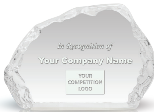
Canada's Top Regional and Special-Interest Crystal Award