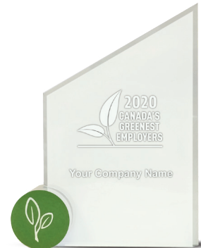
Canada's Greenest Employers Glass Award